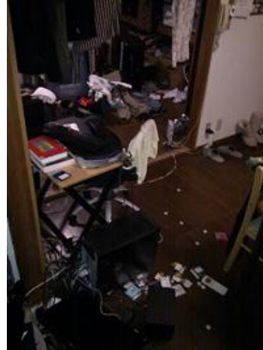
My Tokyo apartment after the earthquake.

From what I remember it was still shaking by the time we got all the way downstairs and outside. It really felt like it was not going to stop.