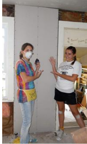
Putting up dry wall inside was part of the crew's job.