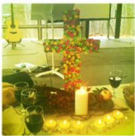
Table during worship