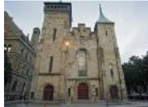
Central Presbyterian Church on S. Third Street

10. They die slowly. They don't die all at once. However, the light of God and the power of the Holy Spirit leave a church a little at a time and the light and love don't return.