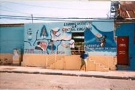
The Learning Centre of Central Kingston in Jamaica is supported by CATALYST.

CATALYST is a mission relationship. Don’t call us a “project.” When we first came into the community in 1997, we asked residents, “How can we work with you?” They responded, “Help us educate our children.” We sought out a local respected partner, Grace and Staff, and made a commitment to develop long-term relationships.