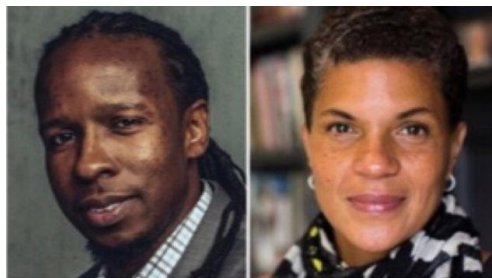
Ibram X. Kendi Award-Winning Historian and Leading Antiracist Voice