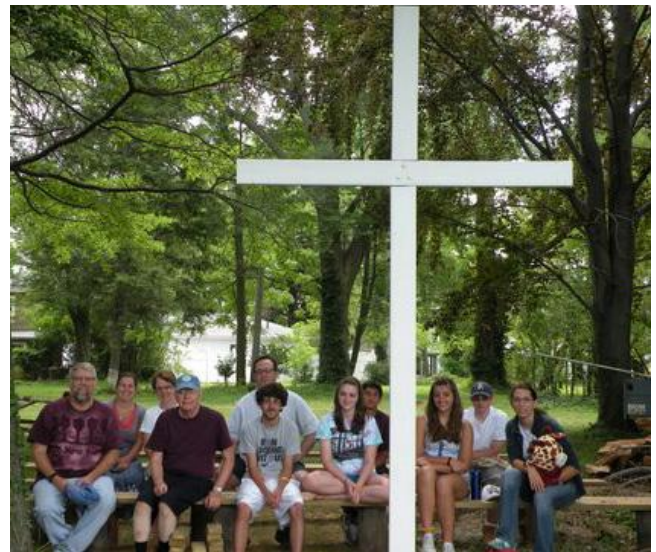
Building an outdoor worship center was part of the work done at Sunset Shores.

Please check out the bulletin board for photos of our week!