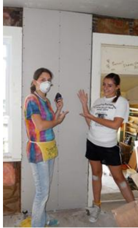
Putting up dry wall inside was part of the crew's job.