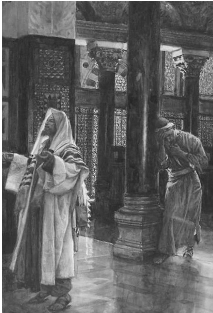
“Pharisee and the Publican,” James Tissot, 1836-1902